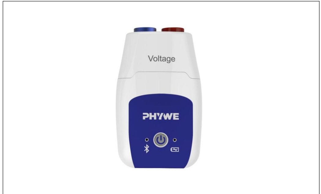
Fig. 1: 12901-01 Cobra SMARTsense Voltage \pm 30V