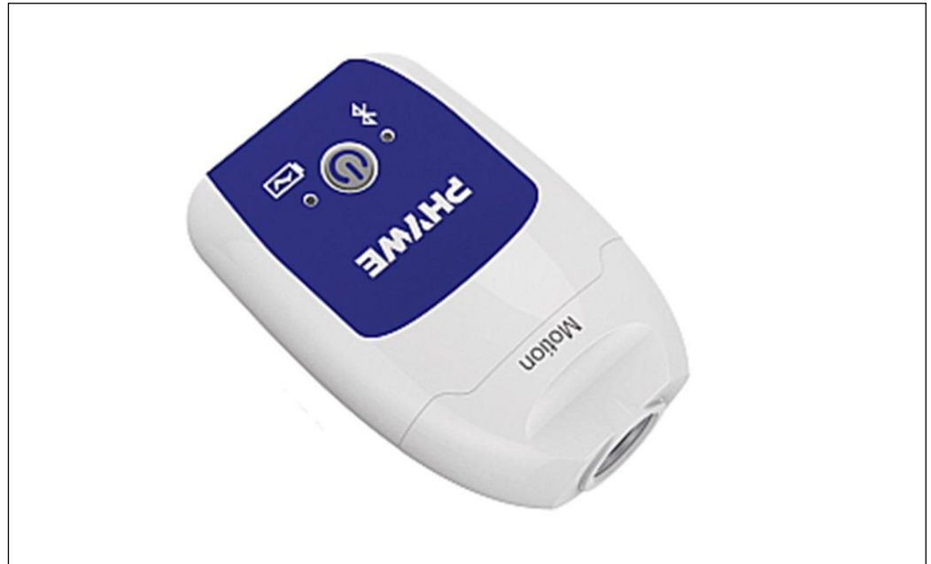
Fig. 1: 12908-01 Cobra SMARTsense Motion