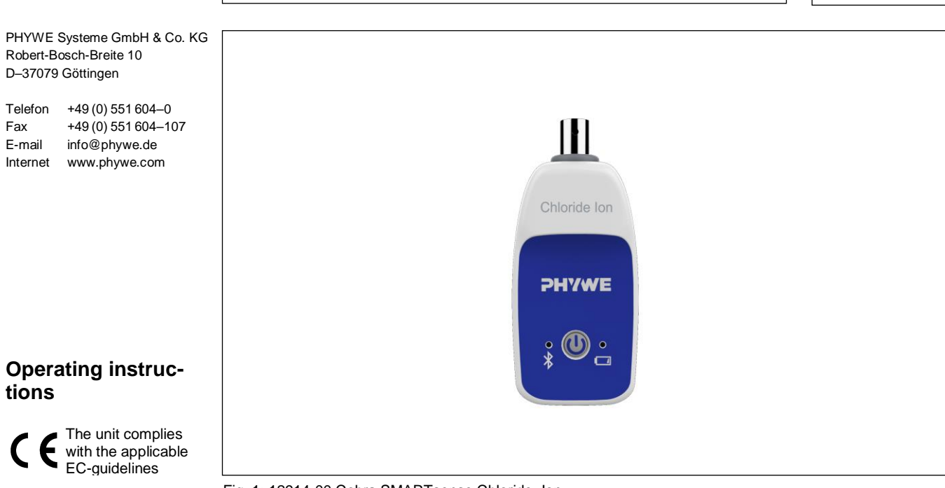
Fig. 1: 12914-00 Cobra SMARTsense Chloride Ion