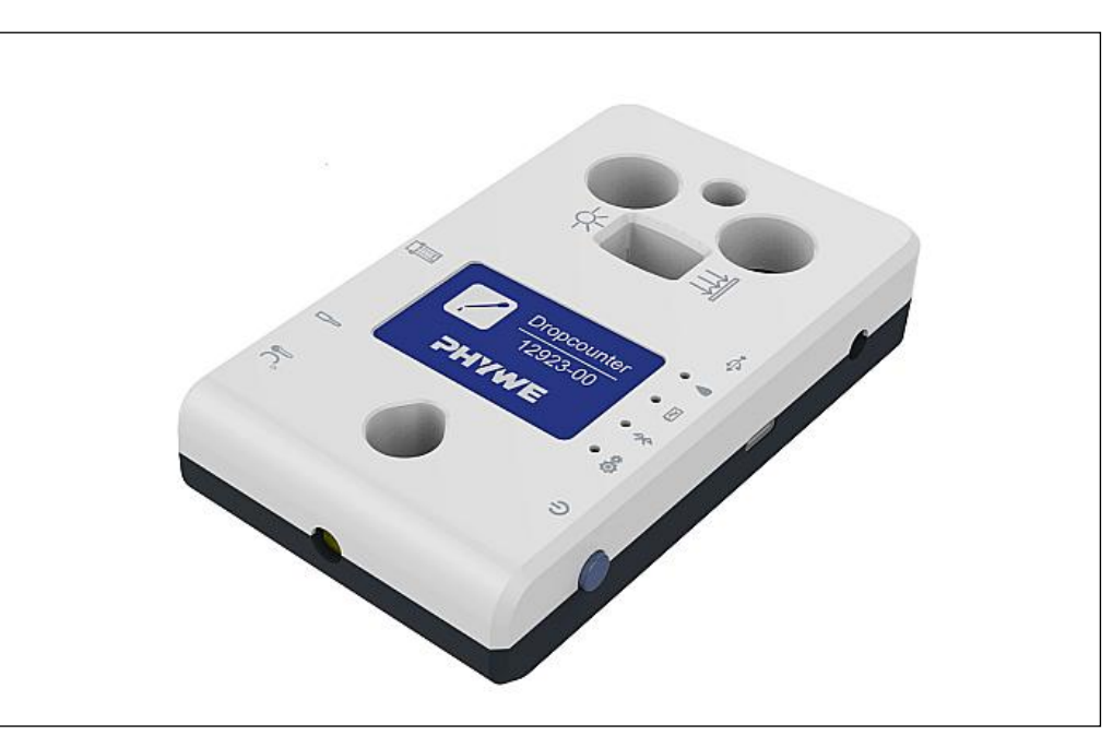
Fig. 1: 12923-00 Cobra SMARTsense Drop counter