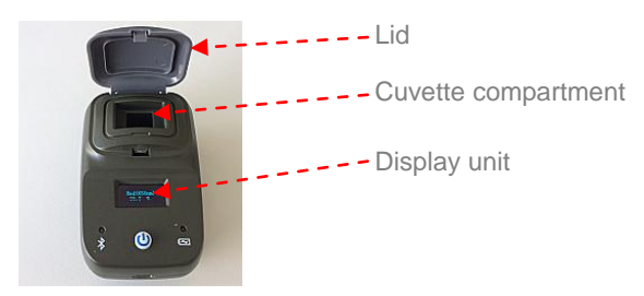
Fig. 2: Functional elements

The cuvette compartment is located under the lid that can be folded up.