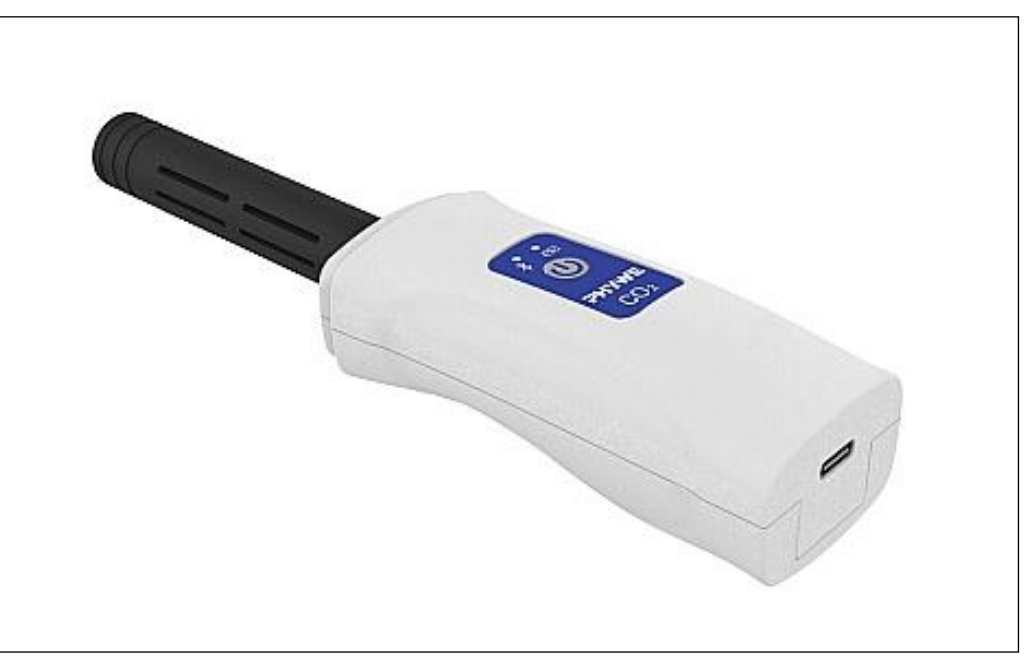
Fig. 1: 12932-01 Cobra SMARTsense CO<sub>2</sub>