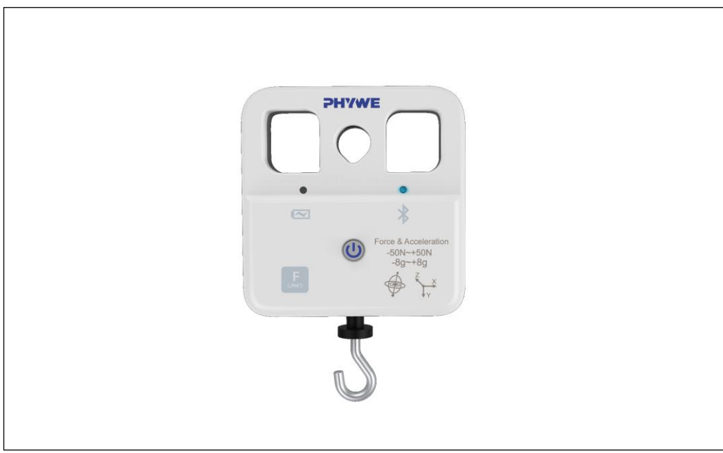
Fig. 1: 12943-00 Cobra SMARTsense Force & Acceleration