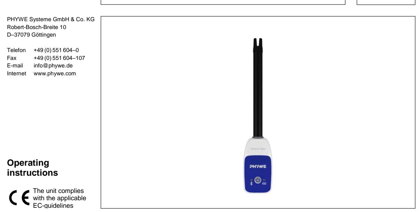
Fig. 1: 12948-00 Cobra SMARTsense Ethanol Vapor